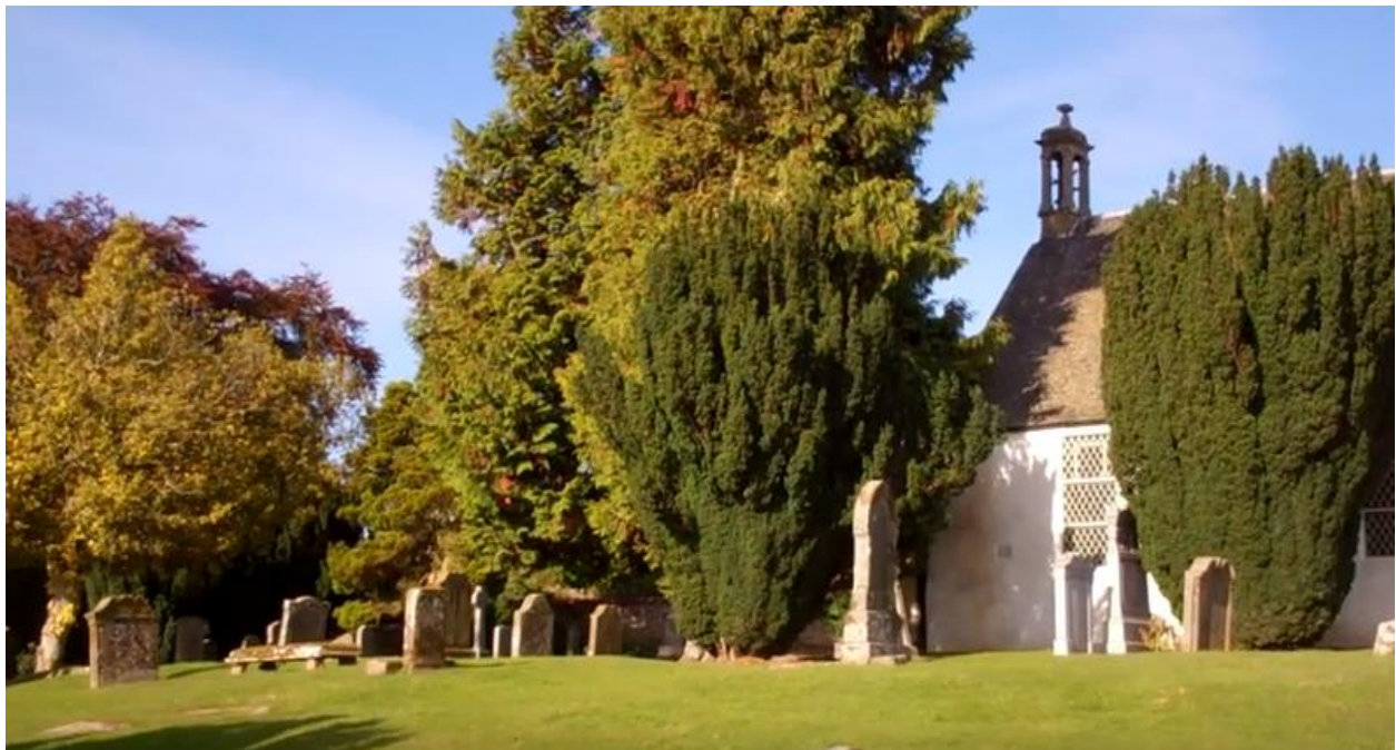
Trinity Gask Churchyard